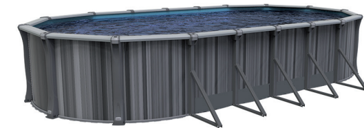
Drakkar wall shown

12'x18' 12'x21' 12'x24' 15'x24' 15'x30' 18'x33'