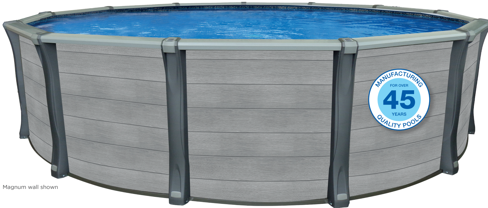
Magnum wall shown